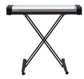
Optional Stand for easy moving and storing.