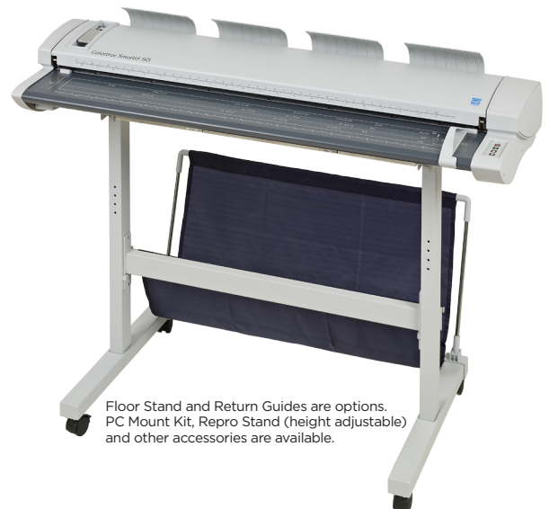
Floor Stand and Return Guides are options. PC Mount Kit, Repro Stand (height adjustable) and other accessories are available.