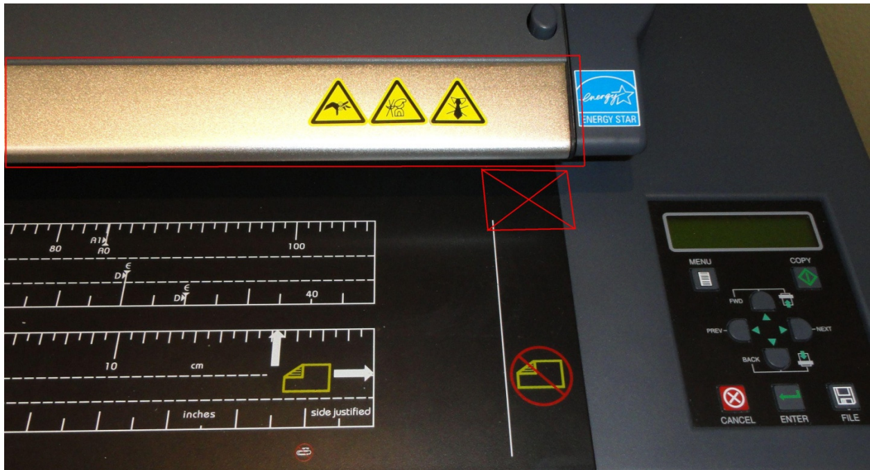
The Gx+ scanner has a silver leading edge on the lid and no paper stop.