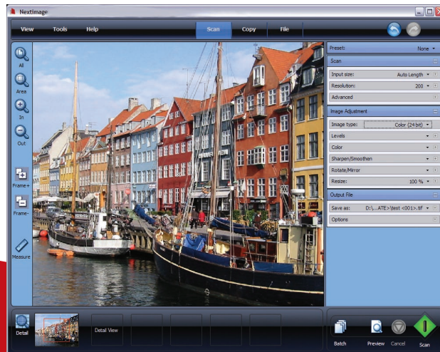
The easy-to-navigate Nextimage interface